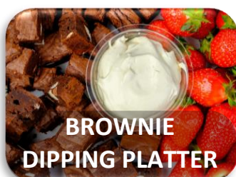
BROWNIE DIPPING PLATTER

£10 Small Platter (4-5) £18 Large Platter (8-10)